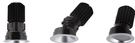
Downlight Adjustable Wall Wash